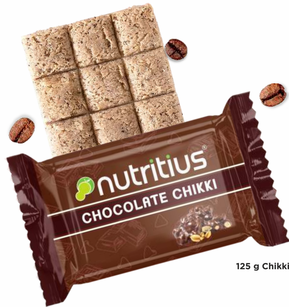
125 g Chikki