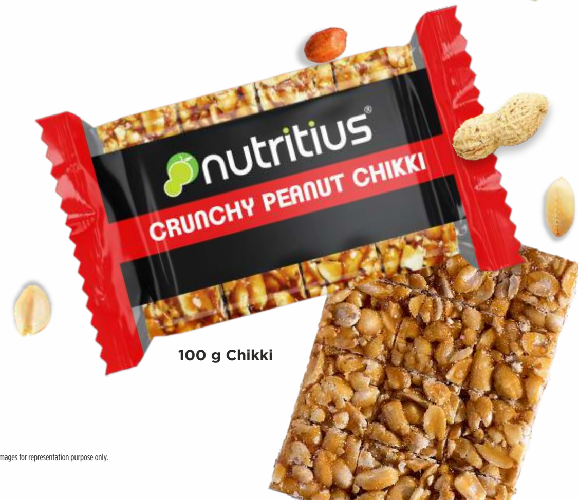
100 g Chikki