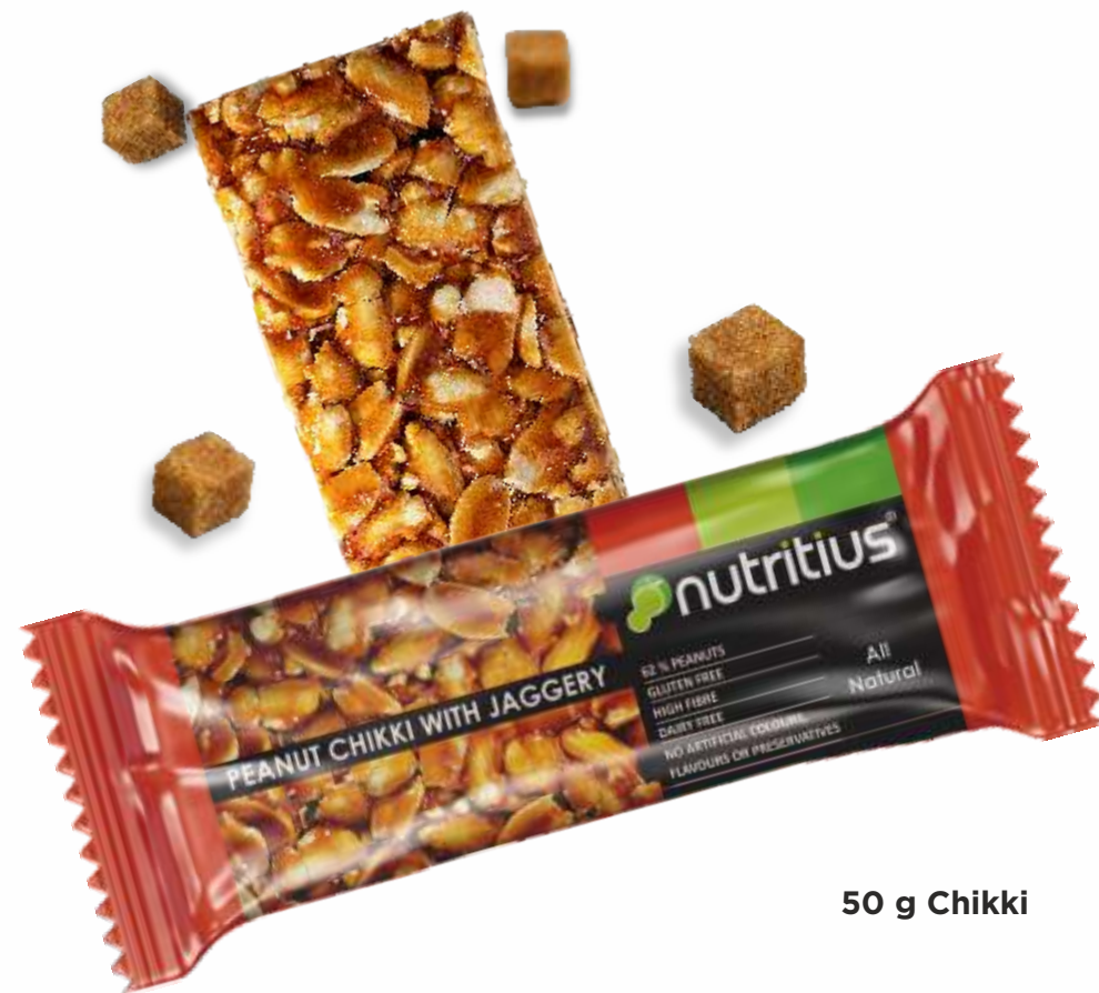
50 g Chikki