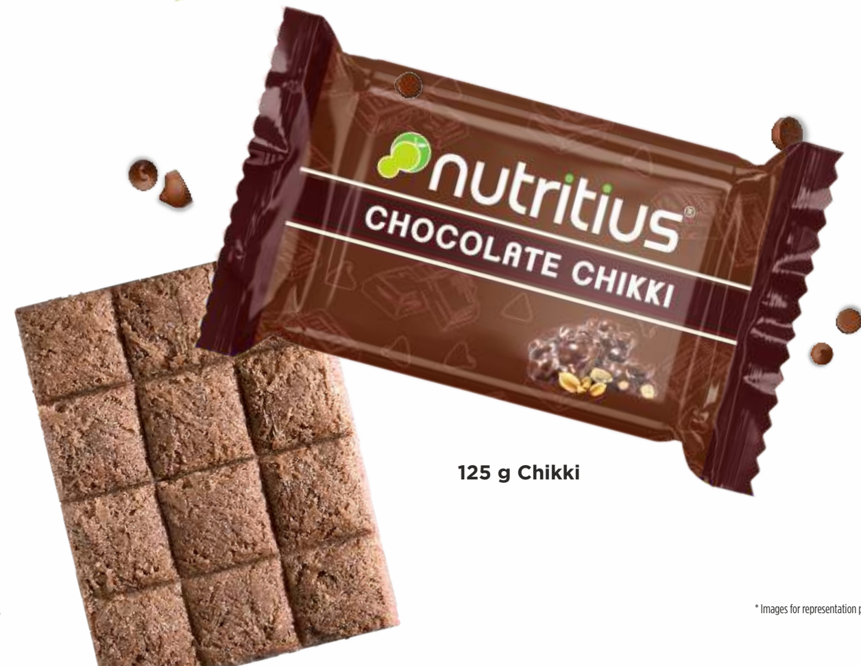
125 g Chikki