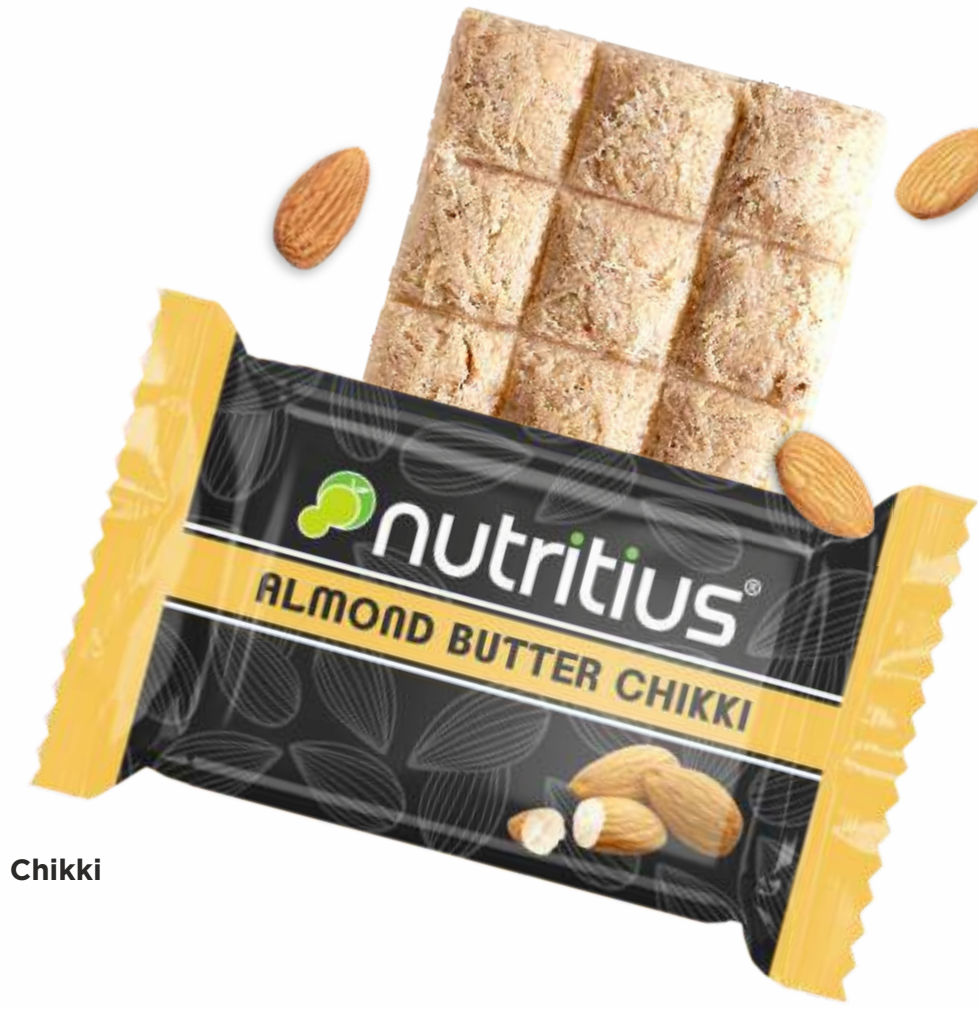
125 g Chikki