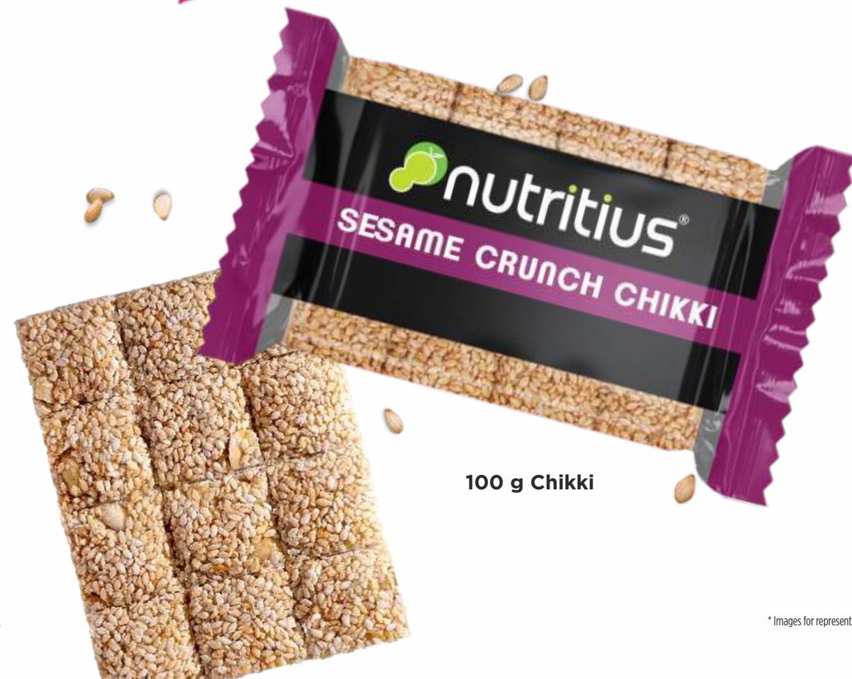
100 g Chikki