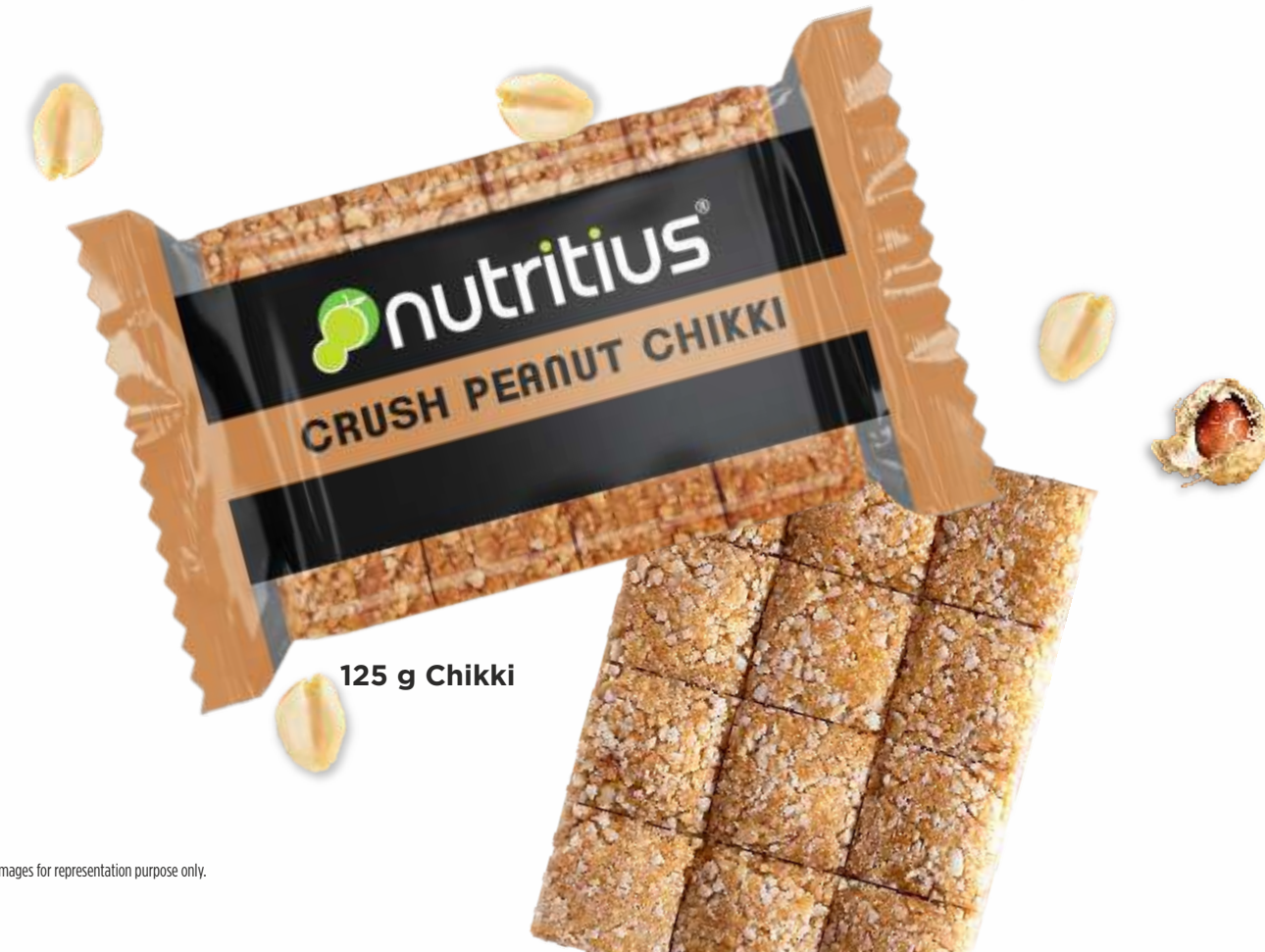
125 g Chikki