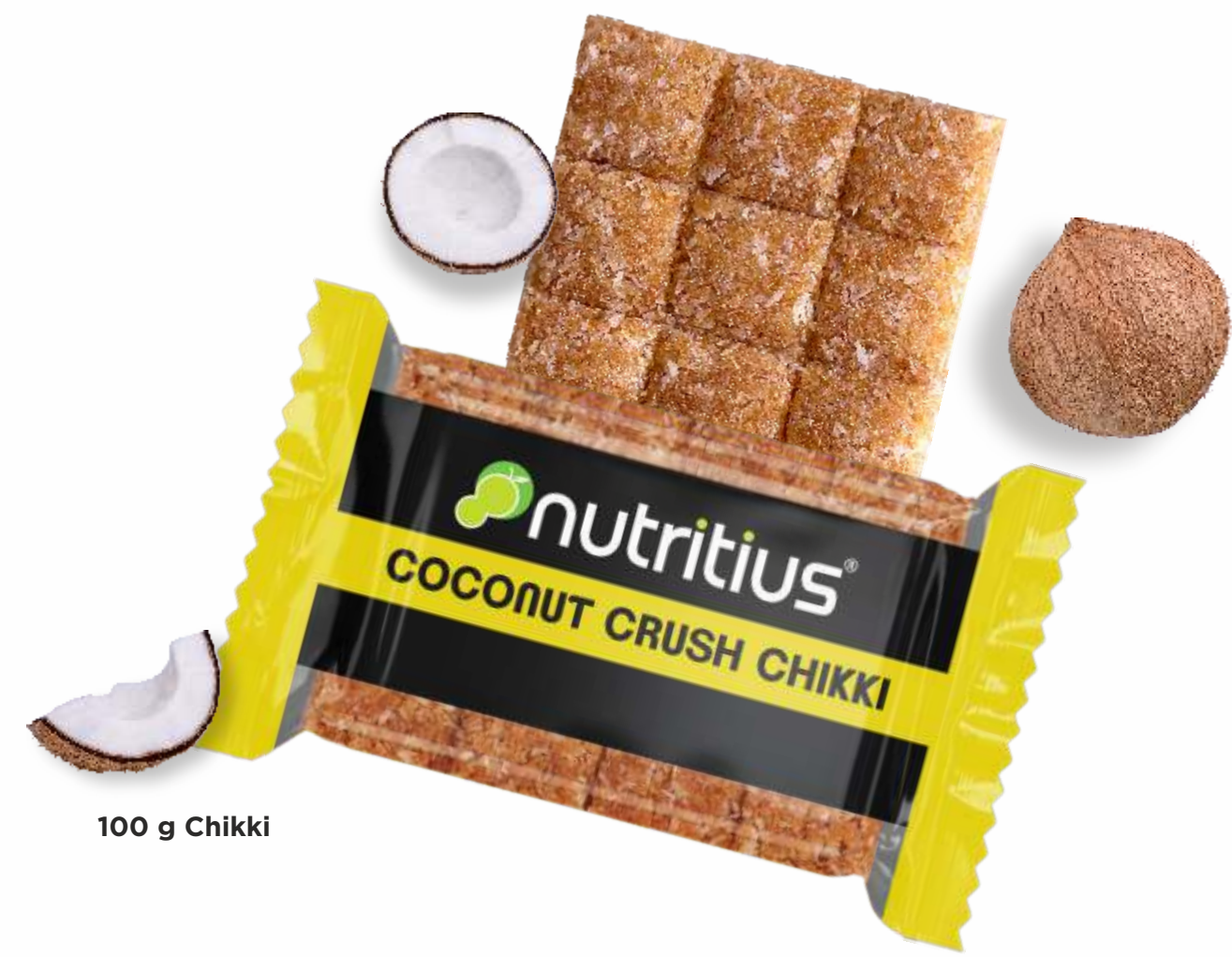
100 g Chikki