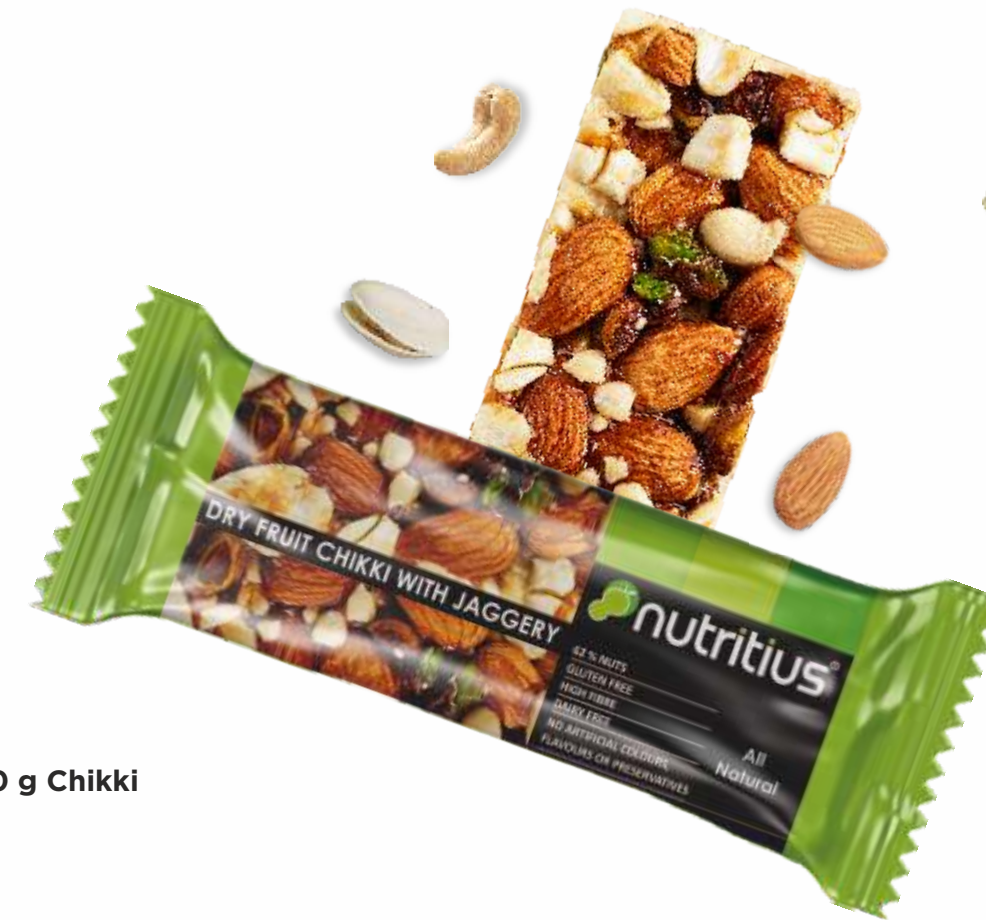
50 g Chikki