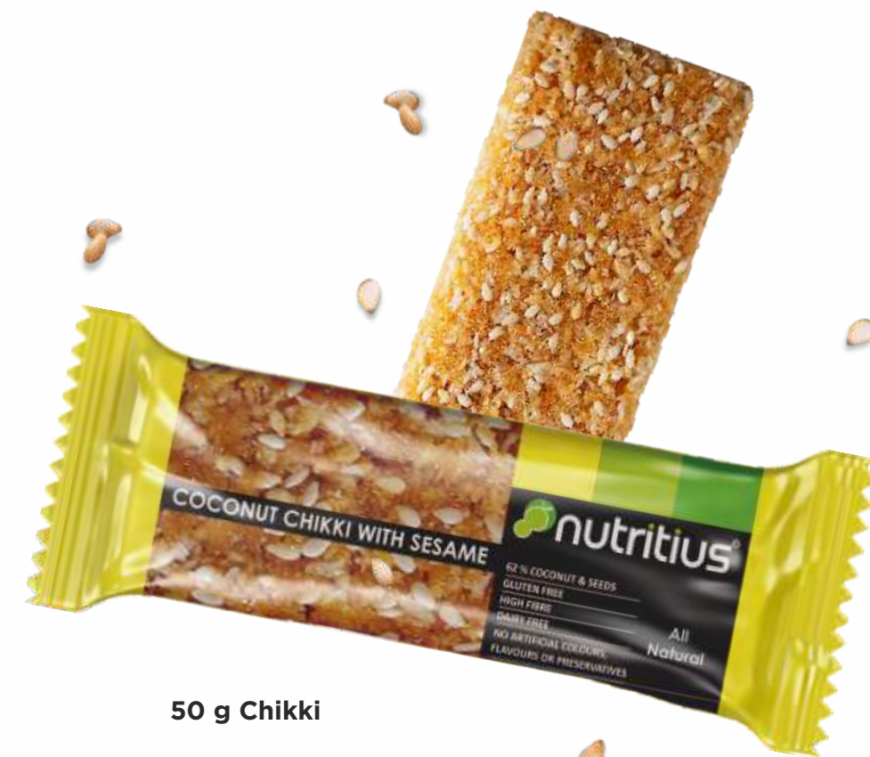
50 g Chikki