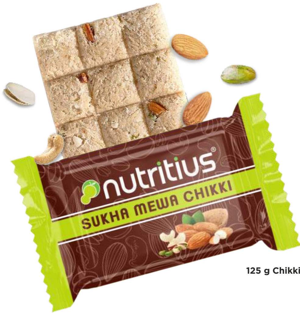
125 g Chikki