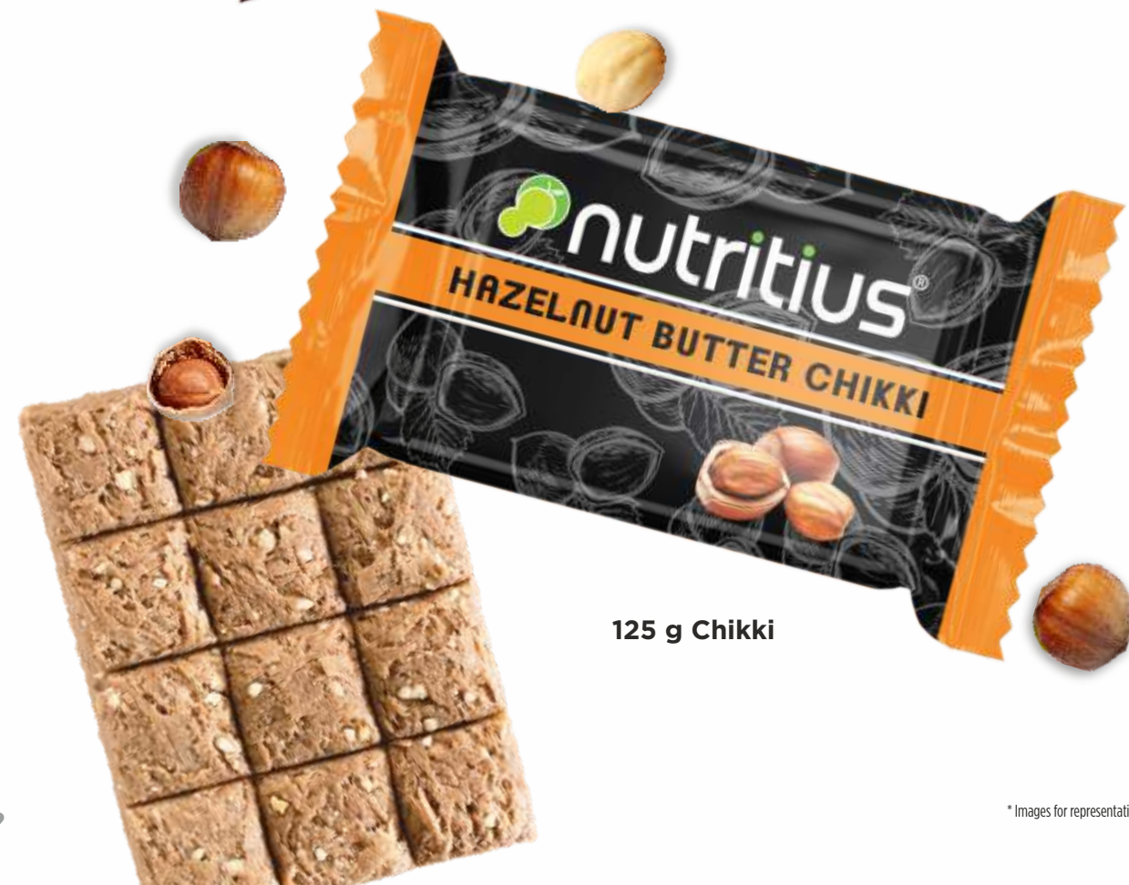
125 g Chikki

* Images for representation purpose only.