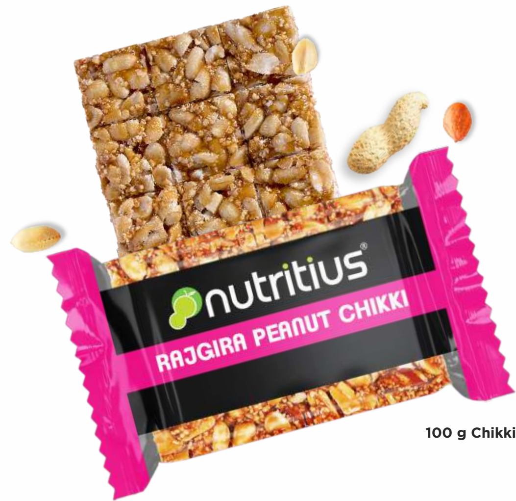
100 g Chikki