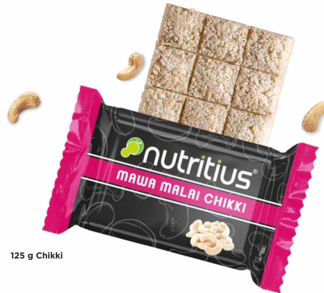
125 g Chikki

* Images for representation purpose only.