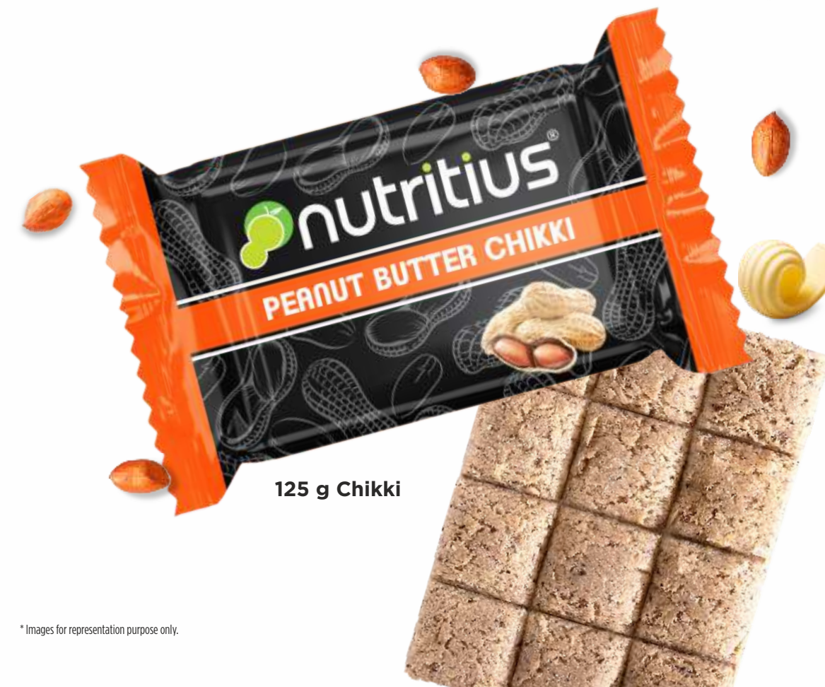
125 g Chikki

* Images for representation purpose only.